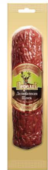
PERELIK Dry Smoked Salami Delicacy vacuum

300 g 34 packs 511 kg e from 0°C to 5°C 934412002 in case 48 cases 60 days