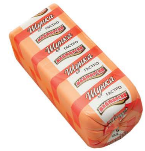
MADZHARSKI Ham gastro