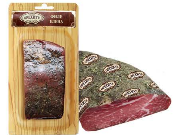
OREHITE Fillet Elena