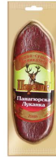
PERELIK Panagyurska Lukanka flat salami vacuum

270 g 34 packs 462 kg e from 0°C to 5°C 934412003 in case 48 cases 60 days