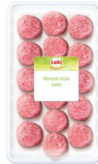
LEKI Mince Balls frozen (HoReCa) ERP CODE 80g 1,280 kg 4 packs 329 kg e at -18°C 936203001 16 pcs plate in case 60 cases 90 days