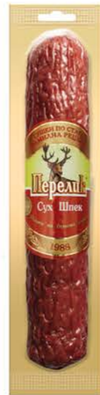
PERELIK Dry Smoked Salami vacuum

300 g 34 packs 511 kg e from 0°C to 5°C 934412002 in case 48 cases 60 days