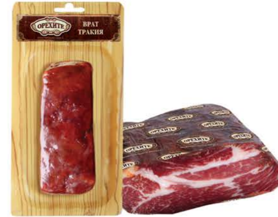
OREHITE Pork neck Trakia