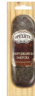
Orehite delicacy zakuska Dobrudzhanska