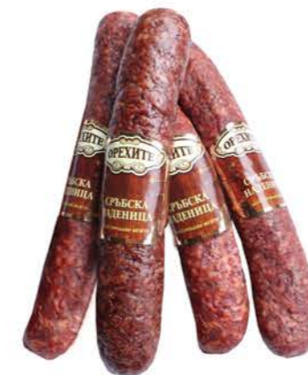
Orehite Serbian sausages