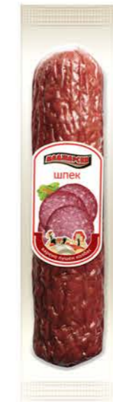
MADZHARSKI Smoked salami vacuum