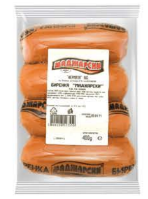
MADZHARSKI Sausage Birenka vacuum