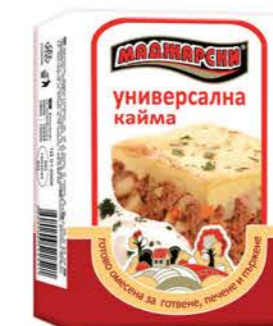
MADZHARSKI Minced meat universal ERP CODE 250 g 40 units 621 kg e at -18°C 937223001 in case 60 cases 60 days