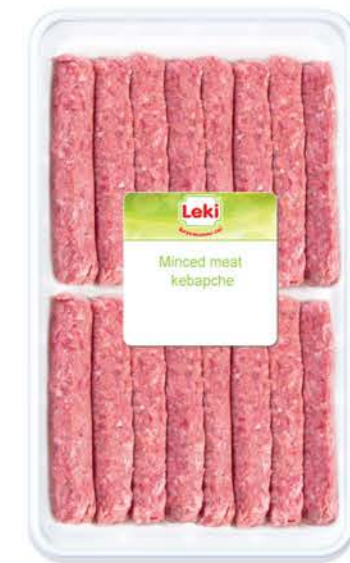
LEKI Kebabche Balls frozen (HoReCa) ERP CODE 80g 1,280 kg 4 packs 329 kg e at -18°C 936213001 16 pcs plate in case 60 cases 90 days